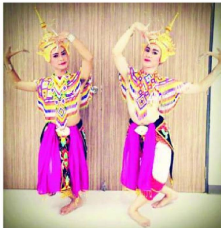
Nora dance (Southern region)