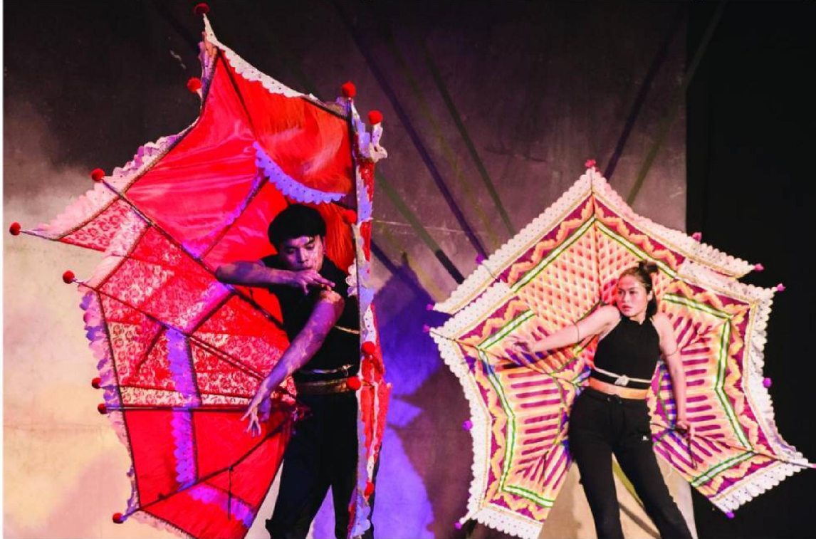
Gingala bird dance (Northern region)

"Kinnara-Kinnaree" presents different works about mythical stories of bird-like creatures from four regions in Thailand;