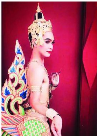
Kinnaree bird dance (Central region)

This work applied Thai traditional folk dance as well as Thai classical dance, creating new dimensions on the mythological bird-like characters.